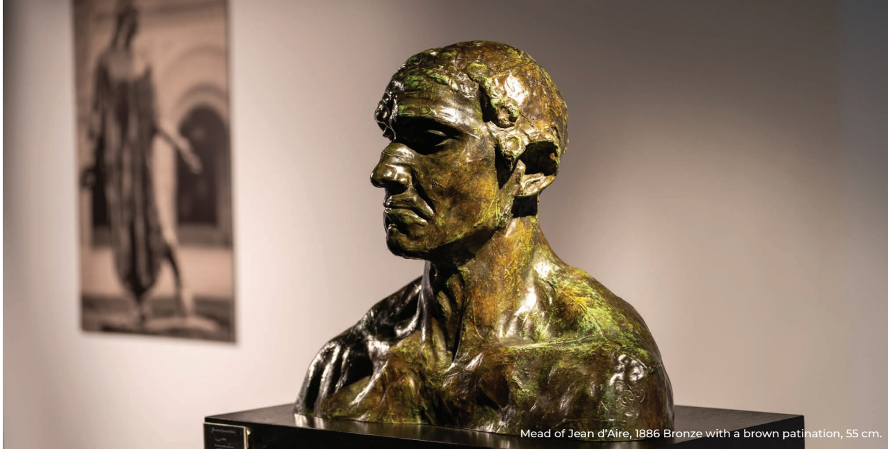
Mead of Jean d'Aire, 1886 Bronze with a brown patination, 55 cm.